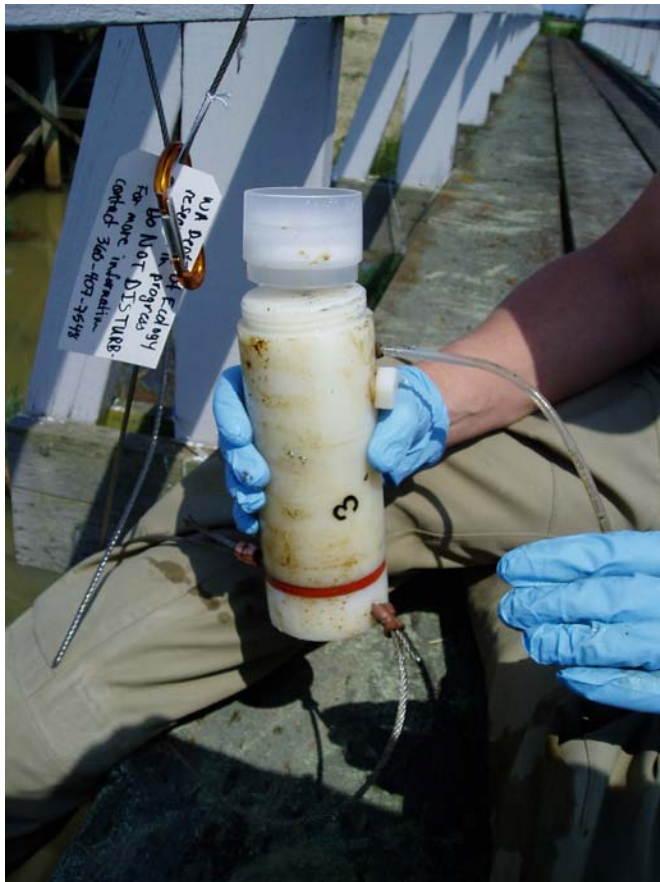
Figure 1. Deploying the CLAM TM device at Indian Creek Slough.

This 2009 intensive sampling project provided an opportunity to test a recently developed inexpensive continuous sampling device, the continuous low level aquatic monitor, or CLAM TM (Figure 1). The CLAM TM uses a pre-set pump system operated at a constant rate so the extracted volume can be estimated. Aqualytical, Inc. provided Ecology with six CLAM TM devices to test during the Skagit-Samish intensive survey. Information on CLAM TM devices and collection disks are provided in Appendix B.