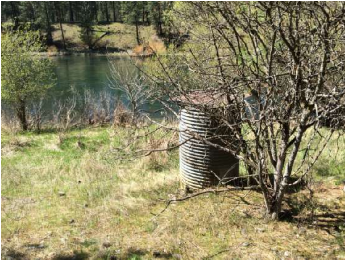
Location of Existing Gage below Nine Mile Dam